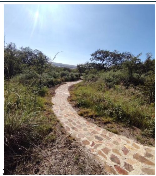
Phase 11 Walking Trail